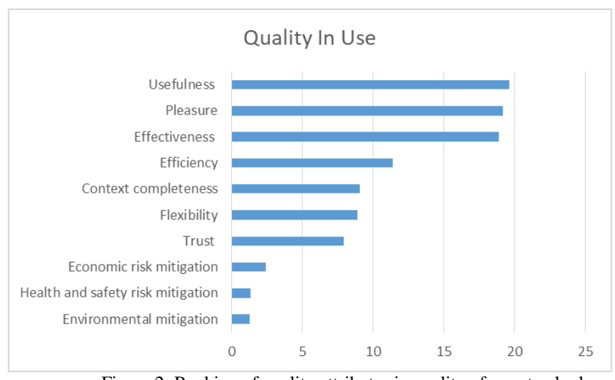
Figure 2: Ranking of quality attributes in quality of use standard

International Journal of Scientific and Research Publications, Volume 9, Issue 6, June 2019 ISSN 2250-3153